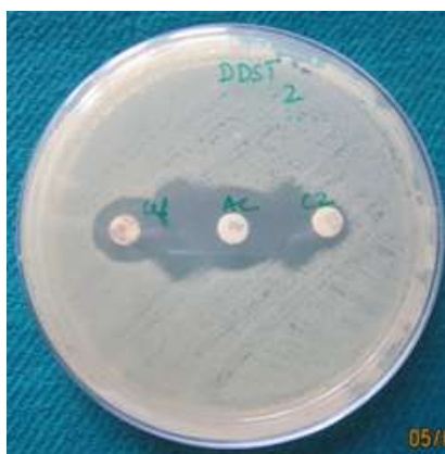
Figure – 2: Double Disc Synergy Test (DDST)

Amoxicillin/Clavulanic acid (20 µg/10 µg) and Ceftazidime (CAZ) discs were placed at a distance of 20 mm from centre to centre on lawn cultures on Muller Hinton agar plates. The plates were incubated at 37 °C overnight. Any enhancement in zone of inhibition of Cephalosporins towards the Amoxicillin/Clavulanic acid disc was considered as a positive result.